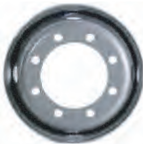
8 lug on 275 mm