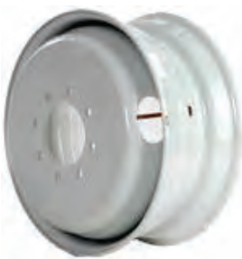
8 lug on 6.5" BC